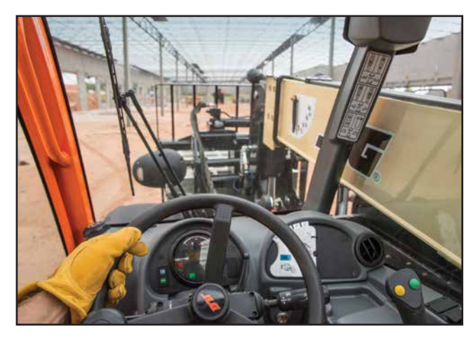
The low-profile hood design and spacious cab interior give the operator more comfort and 360-degree visibility.

For the job site where space is at a premium and productivity is a necessity, the G5-18A telehandler delivers the maneuverability and versatility you need to rise above your challenges.